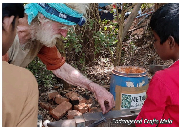
Endangered Crafts Mela

For the past five years, this annual event has helped inspire and introduce school-age children from Auroville and the bio-region to many local, traditional and endangered crafts and performance arts. Over the course of an immersive, experiential week, artisans, craftspersons and performance artists from around Tamil Nadu share their skills, stories, heritage, and passion for continuing the crafts and arts that have shaped their lives.