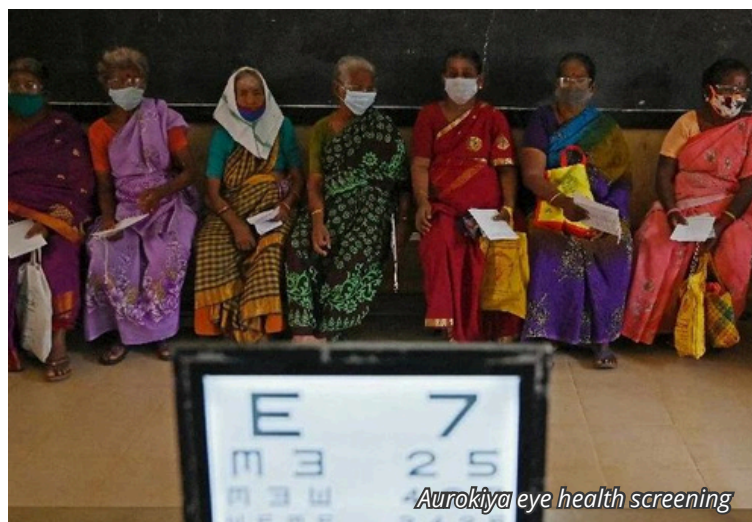
Aurokiya eye health screening