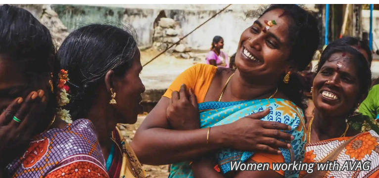
Women working with AVAG

AVAG began over 40 years ago in response to a complex set of local and wider conditions that result in gender inequity, poverty and limited access to resources for development. Its reach now extends across 40 villages, directly impacting the lives of over 5,000 women, 1000 youth, and 3,000 children through participatory community development, economic development, capacity building, and psycho-social support. The component programmes offered by AVAG include: micro-finance, collective work initiatives, psycho-social and physical health initiatives, environmental awareness, livelihood and social enterprise development, expansion of legal access for women and children confronted with human rights abuses, caste integration, exchange programmes, and exposure trips.