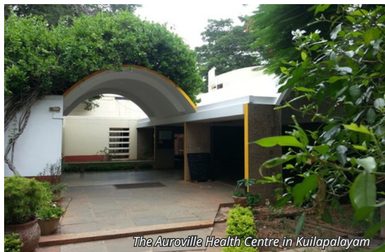
The Auroville Health Centre in Kulilapalayam

Aurokiya offers a primary eye care centre, outreach camps in the bioregion, school and workplace screening programmes, awareness activities to promote eye wellness and classes in eye yoga. This is a fairly recent endeavour started by a third generation Tamil Aurovilian who headed the administration of Aravind Eye Hospital in Pondicherry for 12 years, receiving numerous awards and international recognition for his work. He founded Aurokiya in 2021 to focus on preventive eye care and prevention of blindness in Auroville and the bioregion.