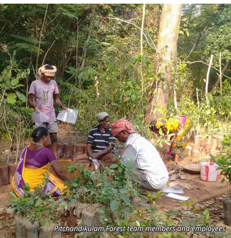
Pitchandikulam Forest team members and employees