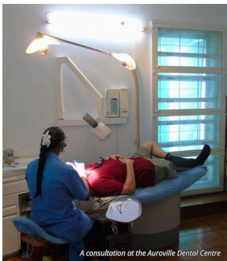
A consultation at the Auroville Dental Centre