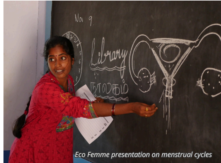
Eco Femme presentation on menstrual cycles