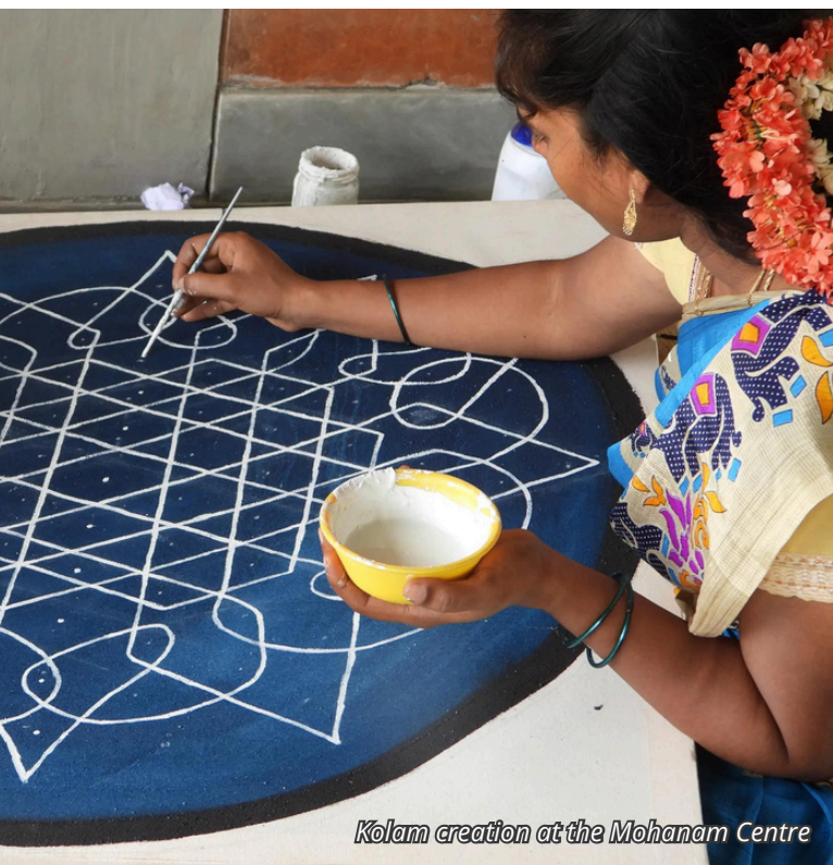
Kolam creation at the Mohanam Centre