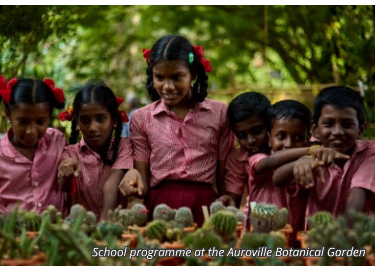
School programme at the Auroville Botanical Garden